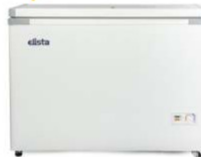
EVL-CF 230 HT1 Chest Freezer 200Ltr HT1