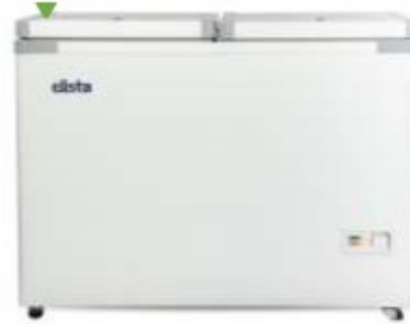
EVL-CFC 330 HT2 Chest Freezer Combi 300Ltr HT2