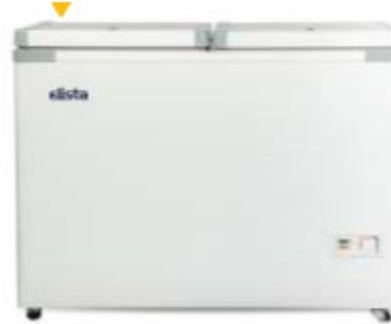
EVL-CFC 430 HT2 Chest Freezer Combi 400Ltr HT2