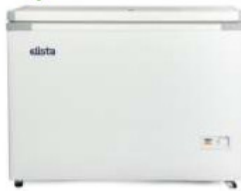
EVL-CF 100 HT1 Chest Freezer 100Ltr HT1